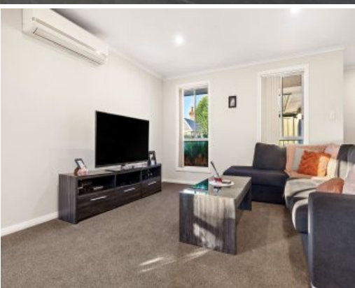
56b Gillies Street Kurri Kurri, NSW